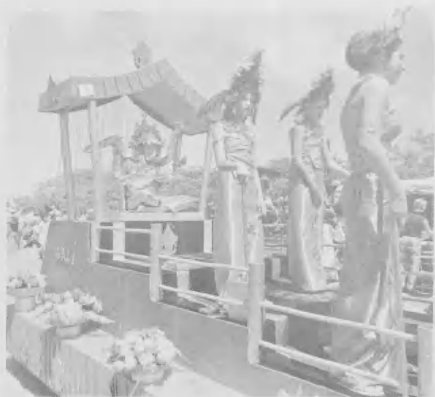
Temple of Ball with Goddesses